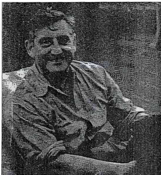
Fig. 3. John Howard Lawson, author of Action in the North Atlantic (1942) and the CPUSA's artistic enforcer in Hollywood.

Communist. 36 The Communists operated like cuckoos, as Edward Dmytryk says, laying their eggs in other birds' nests. 37 Moreover, there is evidence to suggest that some prominent Hollywood people who wanted to join the Party were forbidden by the Party to become members, but were trusted to wield influence over Hollywood individuals and organizations on behalf of Party policies all the same - influence all the more effective for coming from people known not to be in the Party but merely 'leftists'. 38