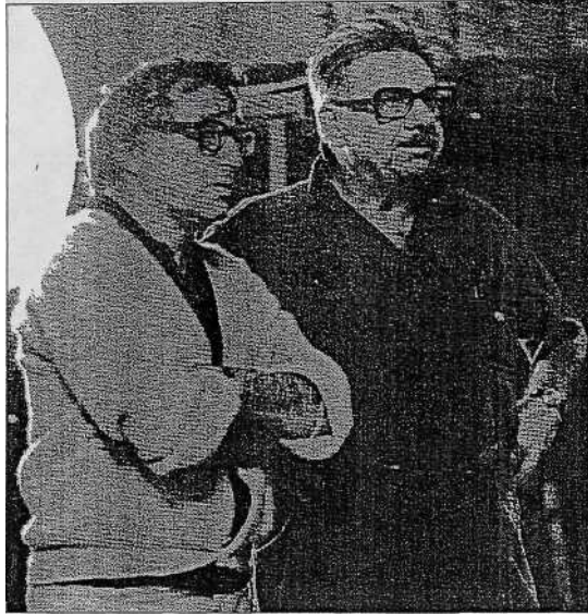
Fig. 1. Walter Bernstein and Martin Ritt on the set of The Front (1972), their semi-autobiographical account of the blacklist era.